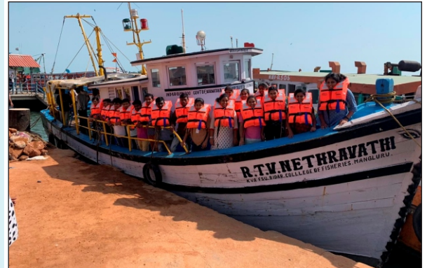
Research & Training Vessel