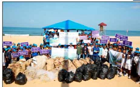
International Coastal Clean-up Day 2019