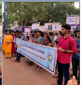
Protest against atrocities on women

of farming to the fish farmers. Further, the departments include Fisheries Resources, Aquatic Environment and Health Management has been doing tremendously important work in the area of promoting science and addressing the needs of the local communities in the region. The Technology Wing of the college which is located at Hoige Bazar has some of the latest food processing equipments wherein various products of fish and shellfish such as sausage, frozen foods and other products are prepared. Product preparation technology could be transferred to the farmers and local communities as livelihood security and entrepreneurship development.