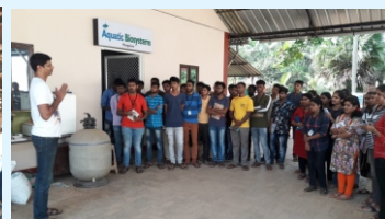
Field visit to Aquatic Biosystems, Vamanjoor, Mangaluru Ornamental Fish Unit - 28 December