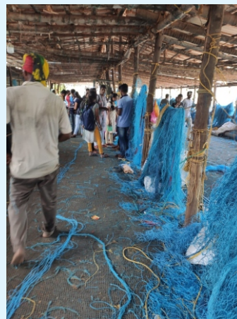
Field visit by B.F.Sc. students to Net mending yard near State Bank, Mangaluru - 28 December 2019