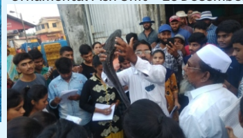
Field trip to the Landing Center, Mangaluru by undergraduate students- 28 December 2019