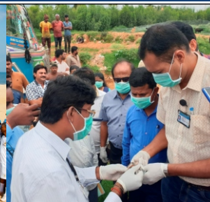
Identification & Reporting of African Catfish